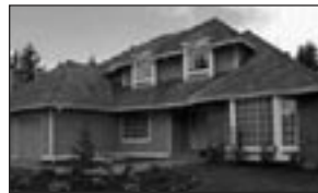
We Hate to Leave Our Springfield Home! You'll love all the updates we've done. Free Recorded Message 1-800-000-0000

You can find out more by calling 1-800-000-0000 for a 24-hour Free Recorded Message. Or you can take a virtual tour of homes at RochesterHomes.com